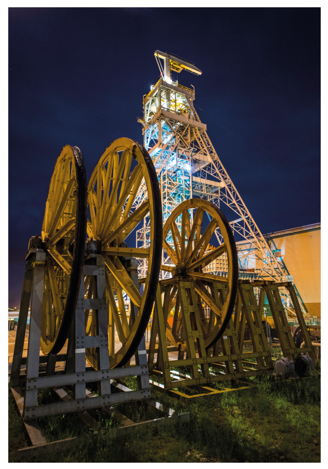
Figure 3-1: Winding gear at platinum mine in South Africa

typically 1:3 or 1:4. The Stillwater ores have similar PGM ratios to the other northern hemisphere deposits, but far lower base metal content. These variances in metal ratios can make substantial differences to refining process strategies and economics.