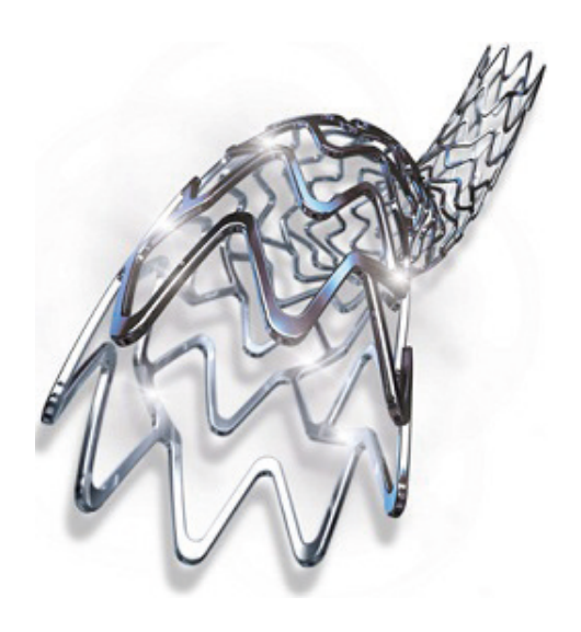
Figure 3-3: Platinum-chromium drug eluting stent

Platinum's mechanical strength. biocompatibility, electrical conductivity, and radio-opacity make it suitable for use inside the human body in devices such as pacemakers, defibrillators, and catheters for the treatment of heart disease; neuromodulation devices to treat Parkinson's disease and hearing loss; and in coils and catheters for the treatment of brain aneurysms. Specific compounds of platinum (the "platins") are effective in the treatment of a range of cancers. PGMs are also widely used as catalysts for the manufacture of pharmaceutical ingredients.